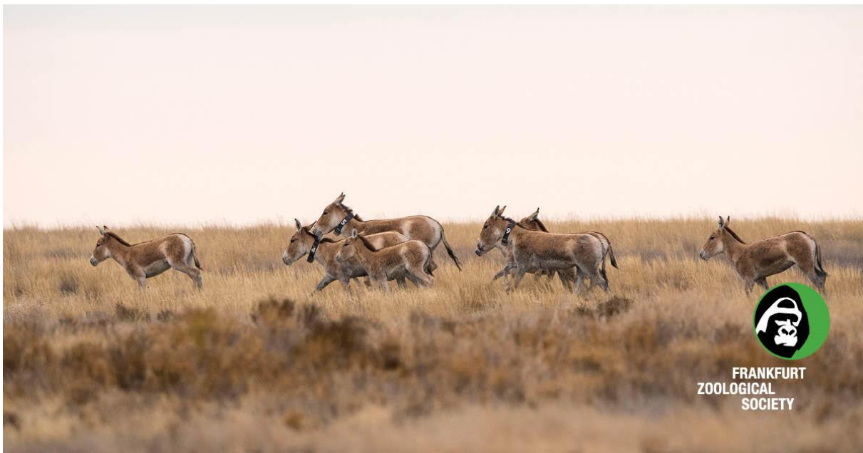
A small herd of wild donkeys (also called "Kulane") in the Kazakh steppe

Frankfurt 17.11.2021 – The Frankfurt fund boutique CHOM CAPITAL supports the Frankfurt Zoological Society ("FZS"). As part of the commitment to donate 10% of the fund sales of the CHOM CAPITAL PURE Sustainability - Small Cap Europe UI to ecological and social projects, CHOM CAPITAL supports the project "Resettlement of wild asses in the Kazakh steppe" with a sum of 5,000 EUR. With this, the Frankfurt stock specialists are making a contribution to the improvement of biodiversity in the Altyn Dala steppe in Kazakhstan and are contributing to the legacy of the famous animal rights activist Bernhard Grzimek, who had a strong influence on the FZS from 1958 onwards.